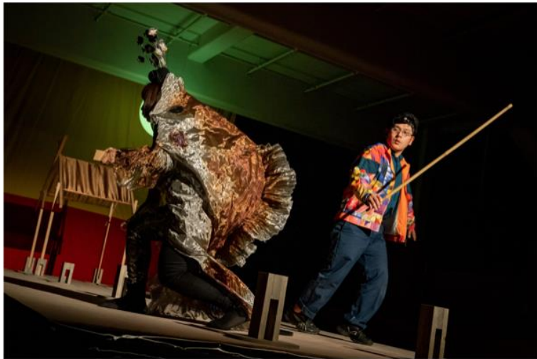
Happy Prince Fish by Kamisato Yudai

Online Zoom event (registration required) with English as the working language